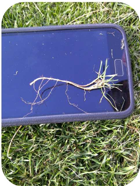
Confidence in South Africa showing lateral spreading

In trials testing spreading abilities, Confidence shows remarkable gains versus other ryegrasses marketed as a spreading ryes.